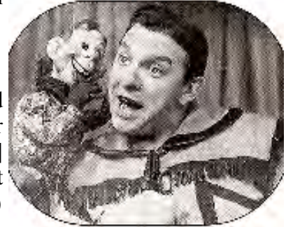
Howdy Doody with "Buffalo Bob" Smith