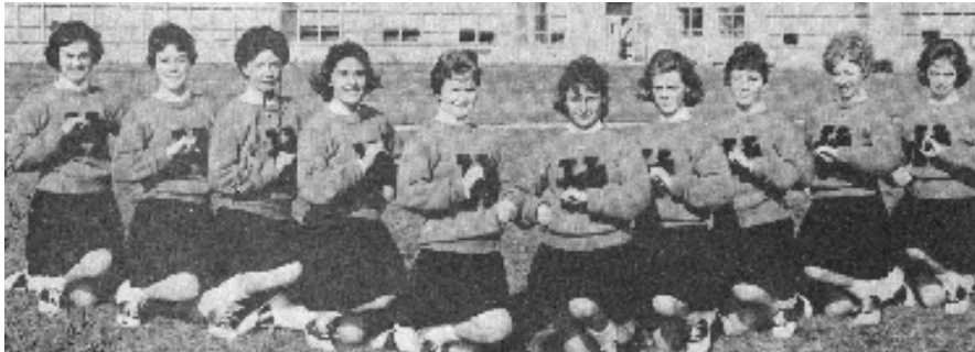
Hicksville High School Jr. Varsity Cheerleading Team 1961